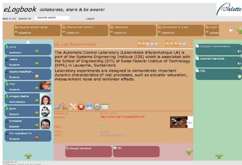
Figure 1: Embedded awareness cues in the Context-Sensitive View. Focal Element: Activity

eLogbook provides awareness of the manipulation of a shared resource. For example, in the context-sensitive view, when a member is editing an asset, a “Lock” icon replaces the editing and deletion icons for other actors who also have the right to edit this same asset. If users move the mouse over the “lock” icon, they will be made aware of who is editing the asset through a pop up message. In addition, and as it was mentioned earlier, delivering all the previously mentioned awareness types, such as historical, presence and group-structural awareness are prerequisites for providing workspace awareness.