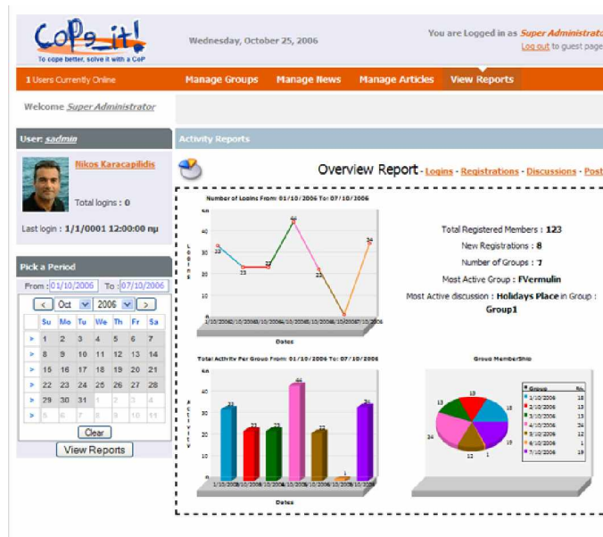
Figure 2: Overview statistical report

The interface of CoPe_it! provides indication of frequency of use of an item. It also provides indication of past activity in a workspace. Icon of clock marks recently changed items since the last user’s login. User can examine the history of the workspace and individual artifacts.