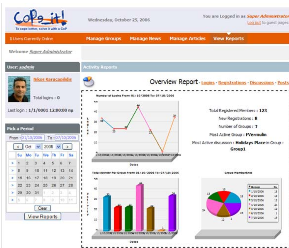
Figure 2: An instance of the reports provided by the tool

In order to establish a high level of sharing and reusing knowledge across domains and tasks, CoPe_it! has been based on a well-defined ontology model. This also facilitates community members in achieving a common understanding, while also enhancing collaboration and exploitation of organizational knowledge resources. Much attention is also paid to reasoning and user awareness issues. Towards this aim, the proposed tool exploits a set of user profiles and activity reports that conceptualize the diverse roles and activities undertaken by stakeholders involved in a CoP. More specifically, through the integrated reasoning mechanisms, discussants are informed about the status of each discourse item asserted so far and may reflect further on them according to their beliefs and interests on the outcome of the discussion. In addition, our approach aids group sense-making and mutual understanding through the collaborative identification and evaluation of diverse opinions. Furthermore, CoPe_it! provides a shared web-based workspace for storing and retrieving the messages and documents of the participants. The knowledge base of the system maintains all the above items (messages and documents), which may be considered, appropriately processed and transformed, or even reused in future discussions. Moreover, the tool supports multi-level user management and it can be accessed through major web browsers.